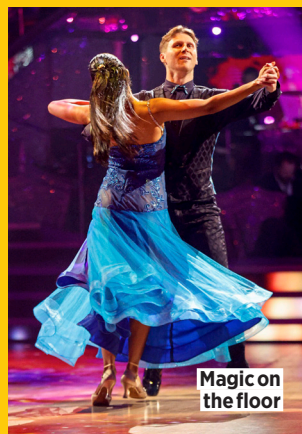
Magic on the floor

J: Maybe that slipped out unconsciously. [Laughs.] But, I don't mind... We love all that banter, so we want to keep that going. ■